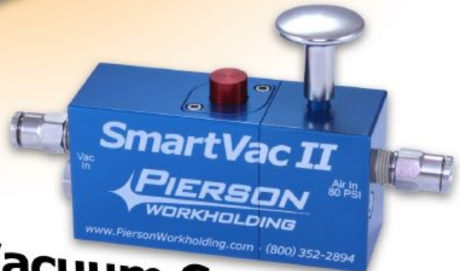
Vacuum Control Unit