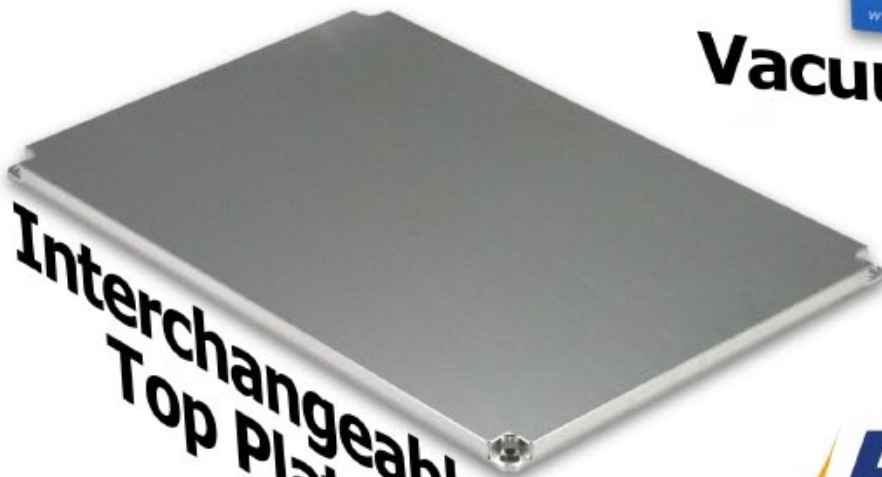
Interchangeable Top Plates